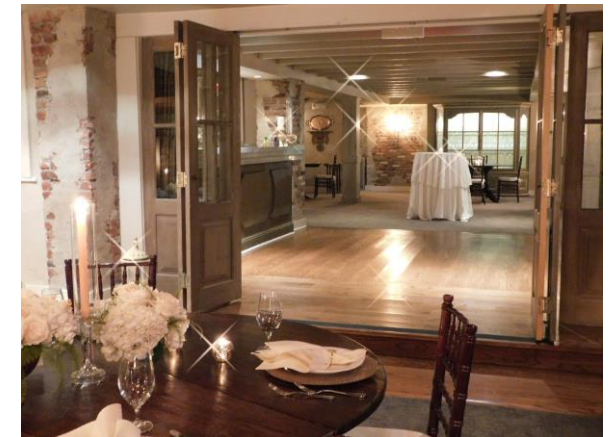
Dining Room looking into Bernie Bar