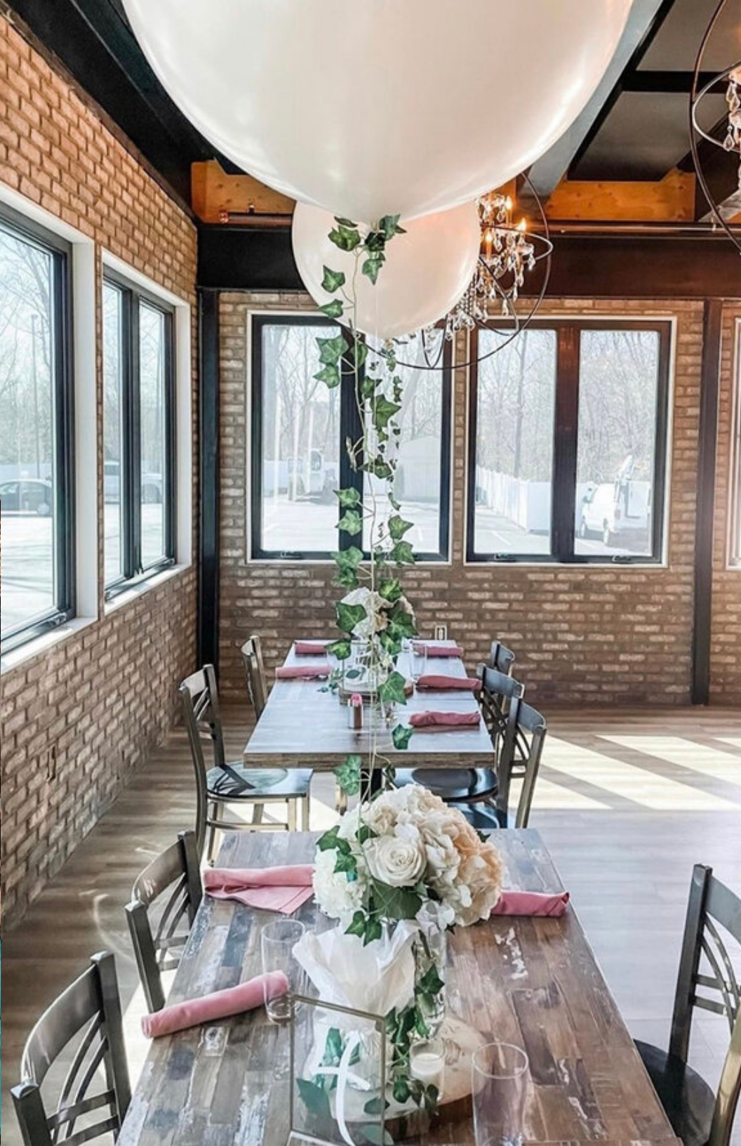
The All Seasons Room