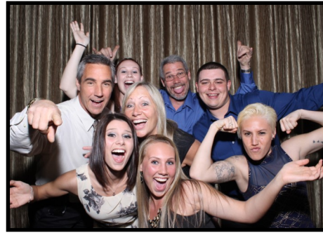
Photo Booth Studio

The most common setup of the Open Air Photo Booth incorporates a photographic or green screen backdrop with or without the use of a bench. The recommended floor area required for setup with bench and backdrop is approximately 8' by 8'. Ultimately, the versatility in setup is only limited by the imagination of the client and the physical constraints of the event space. Groups of 10-20 have gathered in front of the Open Air Photo Booth to have their images taken.